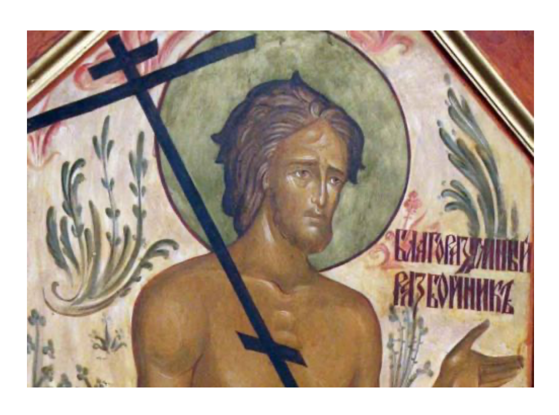
The Wise Thief

The wise thief You made worthy of Paradise in a single moment, O Lord. By the wood of the Cross illumine me as well and save me, and save me.